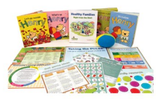
The HENRY Parent Toolkit - free to everyone joining a HENRY programme

The HENRY toolkit will help you give your child a great start in life, get the whole family involved, and keep track of how well you're doing.