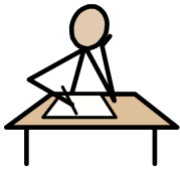
Learning Task 2