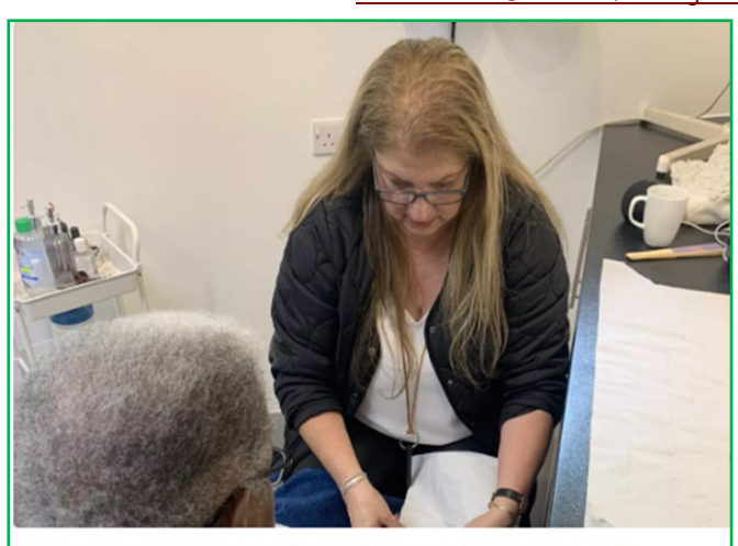
Free pampering sessions for people living with dementia and carers

If you are interested then please telephone the Dementia Hub on 0208 558 0647 or email them at dementia.hub@walthamforest.gov.uk